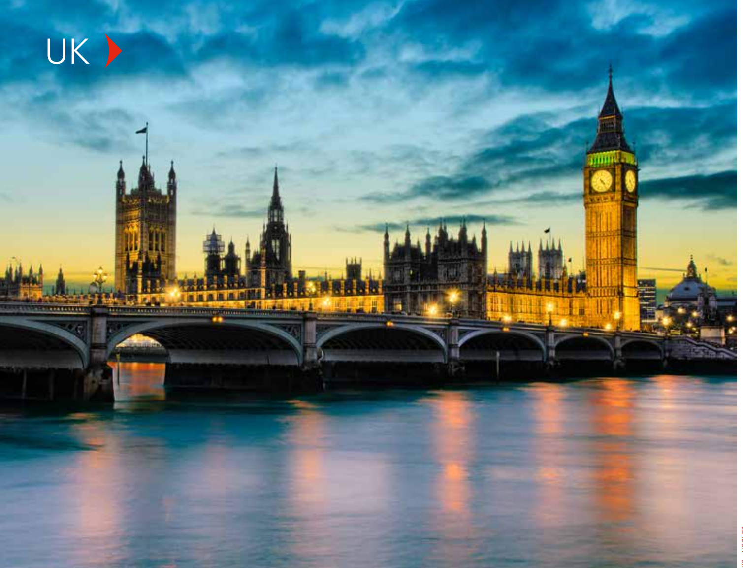
LONDON - UK