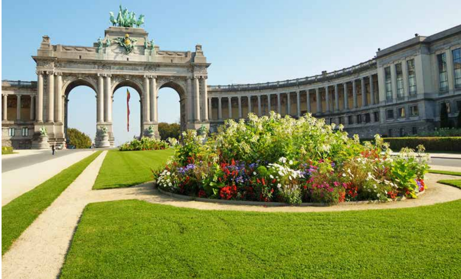
BRUSSELS - BELGIUM