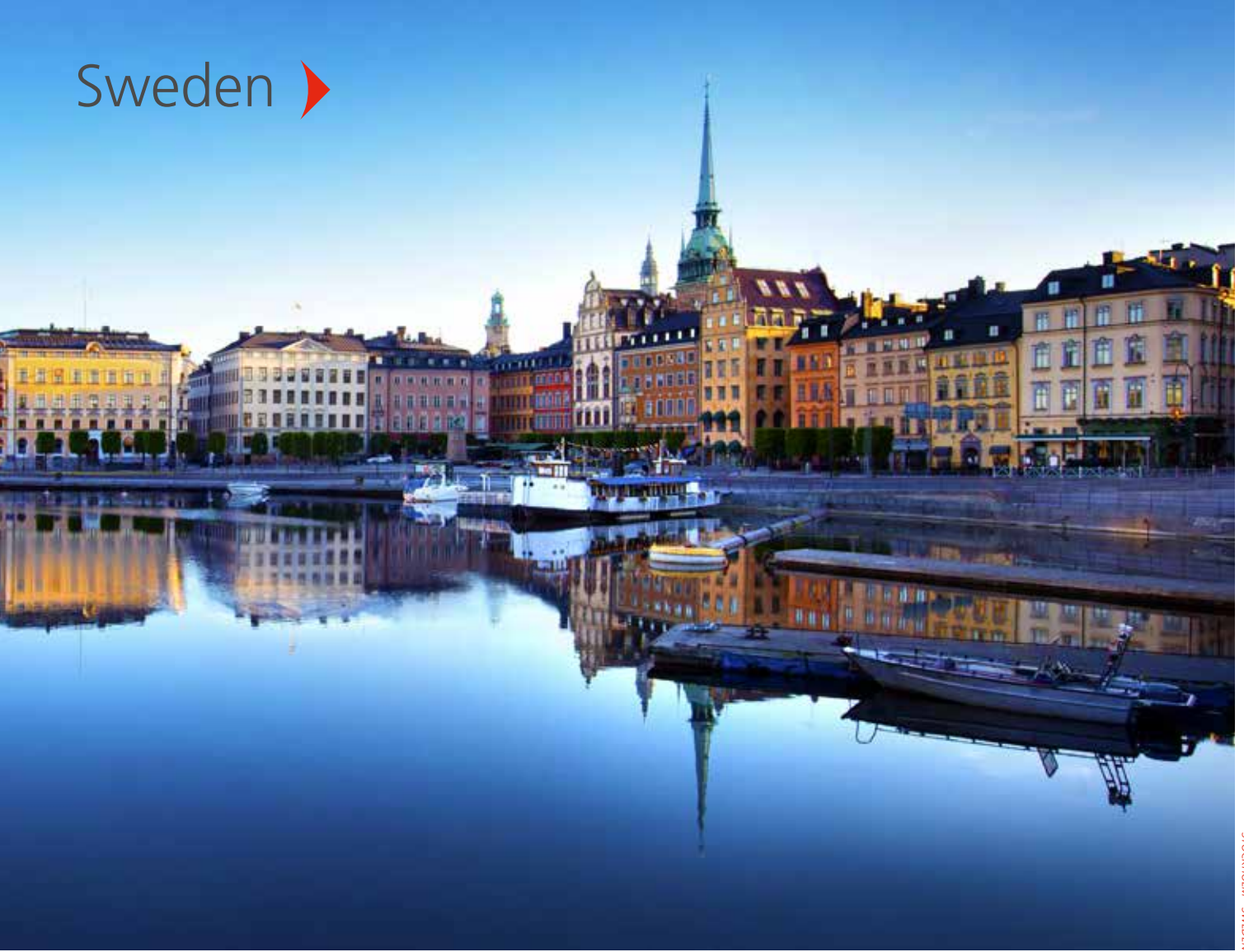
STOCKHOLM - SWEDEN